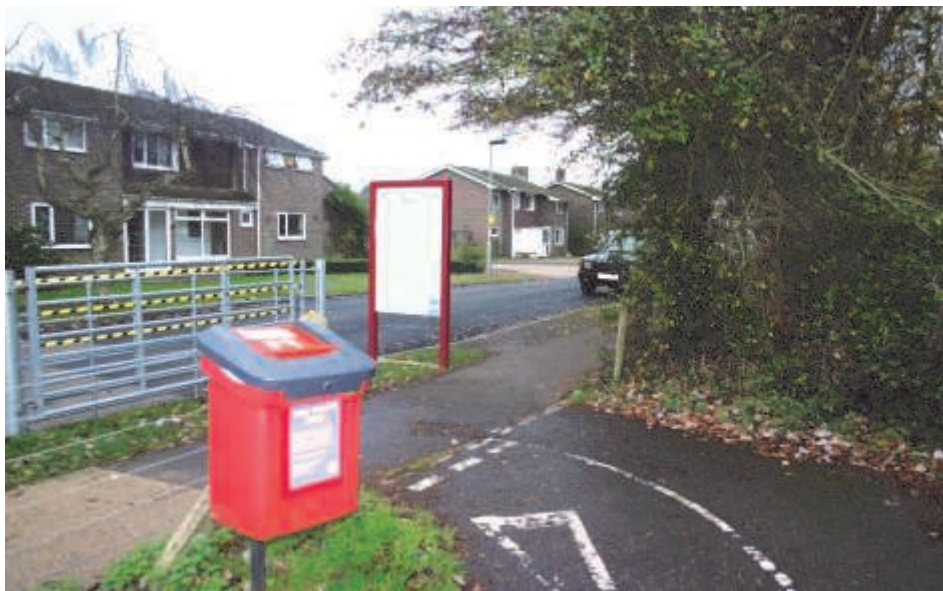
But the entrance doesn't do it justice to such a prestigious location (unless perhaps you are a dog with a stomach upset?)

Sussex Archaeological Society is not in a position to fund the re-routing of the cycle path, and is therefore faced with exercising their right to withdraw from the lease with Sustrans. After initial enquiries, Sustrans confirmed that they too were not in a position to support the re-routing of the cycle path financially. Their expectation, should Sussex Ar-