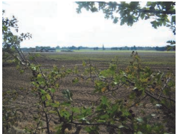
Oldplace Farm (in the lower Lavant Valley)

These areas would suddenly expand Chichester into good agricultural land - and both are under active investigation by developers, as well as the Daffodil Field featured in our last issue.