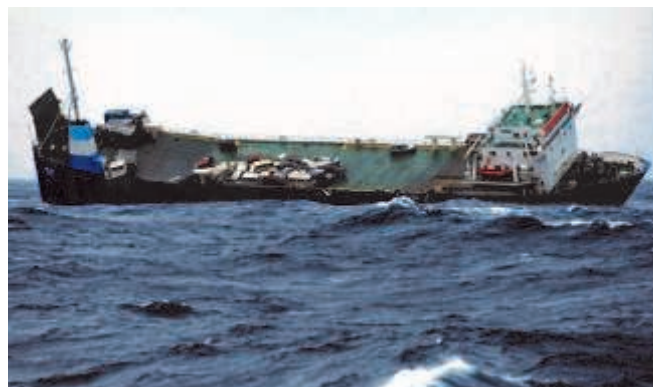
The Society made a gallantry award in 2011 to the helicopter crew of HMS Chatham, who rescued the crew of the MV Dubai caught by a tropical storm in the Indian Ocean

Special grants are made to meet crises or specific needs, covering items from essential household electrical goods, carpets and clothing to rent arrears and stair-lifts. Grants of over £1.5 million were made last year. We also ensure that our beneficiaries are claiming their correct entitlements. Last year our grants team helped 24 people claim over £45,000 in benefits which they were unaware of, mainly Pension Credit.