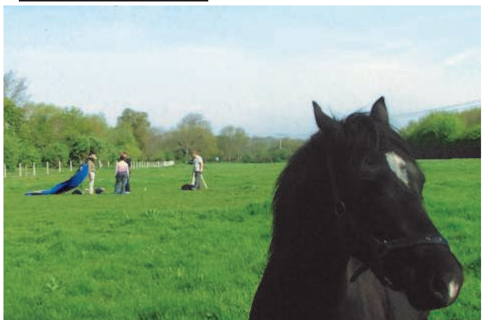
The northern paddock with filming taking place; investment could provide enhanced facilities here.