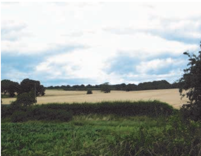
White House Farm (next to Centurion Way)

Reports to the Council's Development Committees last July explained the status of 'saved policies' and assessed how well they can be relied upon before the new Plan becomes official in autumn