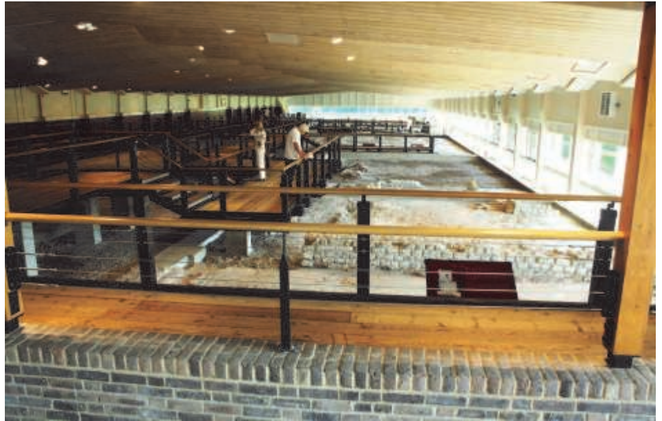
A heritage site of national importance. This is the largest Roman domestic building north of the Alps.

Since 1995, the SAS has leased the land on which the path is constructed at a nominal charge to Sustrans (the organisation who manage the national network of cycle paths). The footpath, which separates the Palace's northern paddocks from the rest of the site, is not a public Right of Way. Yet it is a pop-