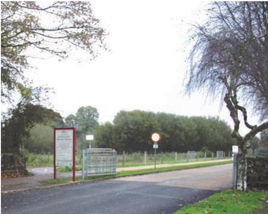
The fence alongside Emperor Way presents few problems to potential intruders, and cuts the site in two.

chaecological Society decide to withdraw, would be to re-route cyclist and pedestrians along Fishbourne Road (A259) rather than construct a new route on Palace grounds.