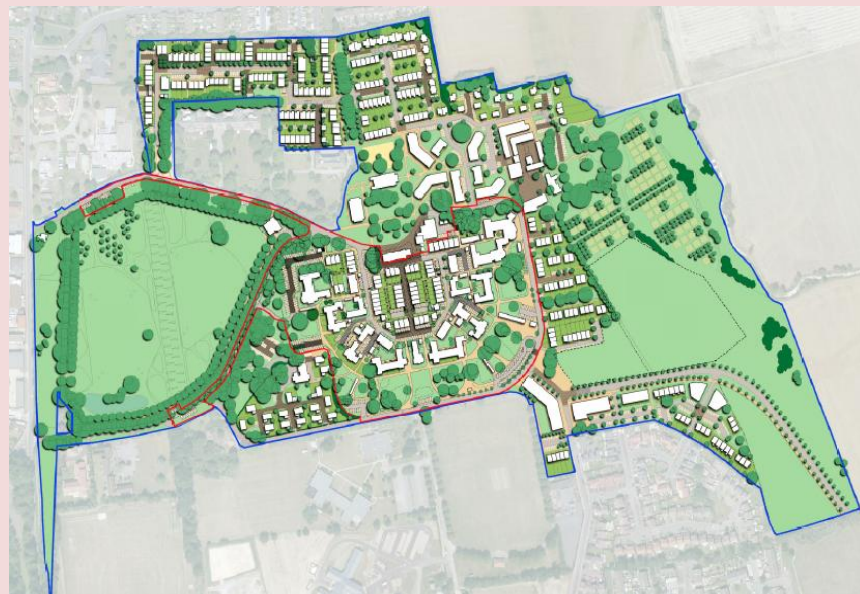
Graylingwell Masterplan – John Thompson and Partners

5.1.1 Masterplanning provides a means to shape a site, area or whole town centre often within a specific time frame. It is an opportunity to bring a range of projects and sites together as a co-ordinated framework to deliver regeneration and economic growth. Development of a Masterplan brings together the full range of stakeholders including developers, infrastructure providers, local authorities and local communities to work together to deliver a shared vision for the area or site.